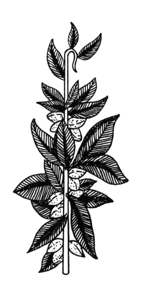
Vol. 1, Nos. 7, 8