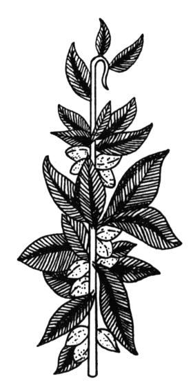
Vol. 2, No. 35